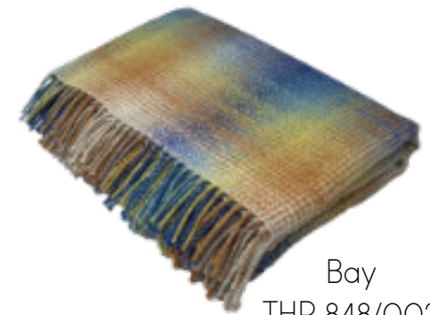
Bay THR 848/002