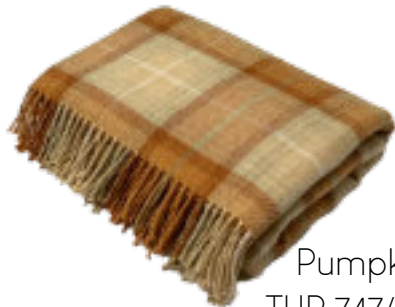
Pumpkin THR 747/003