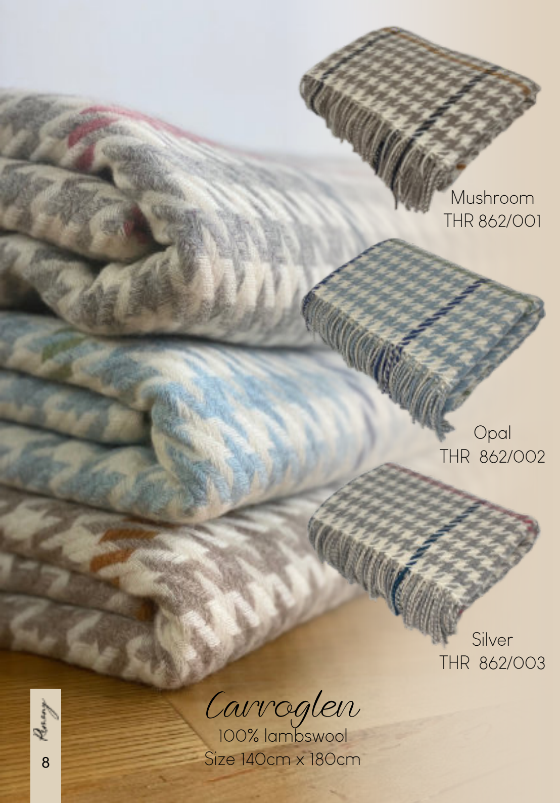
Mushroom THR 862/001