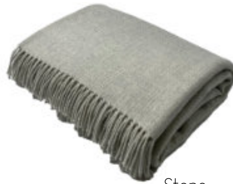
Stone THR 849/003