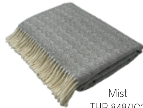
Mist THR 848/102