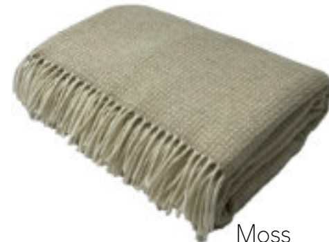
Moss THR 849/002

Balintyre 100% lambswool Size 140cm x 180cm