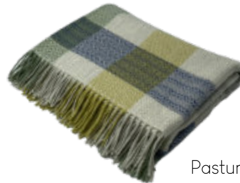
Pasture THR 831/004