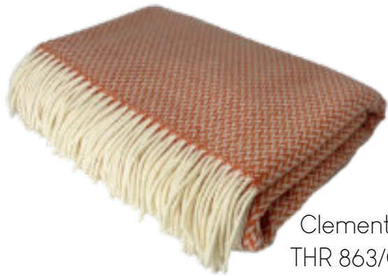
Clementine THR 863/005