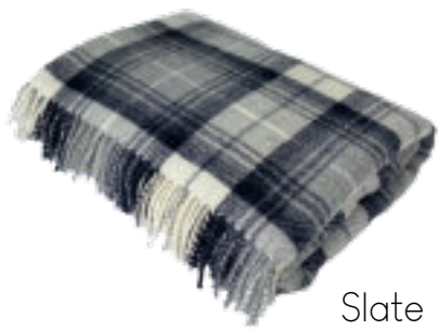
Slate THR 747/007