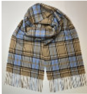
BLUE STONE WWS795/202