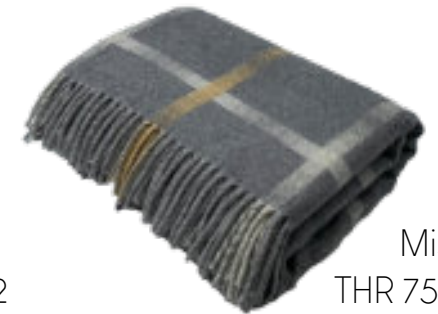
Mist THR 756/034