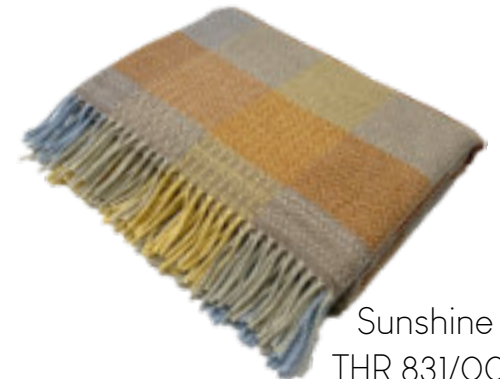
Sunshine THR 831/001