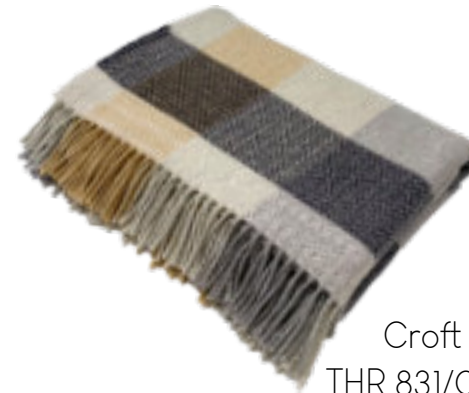
Croft THR 831/003