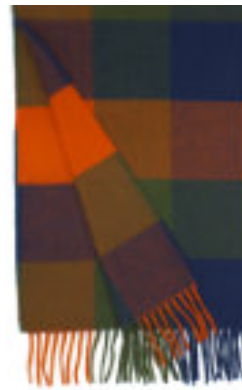
STARFIRE – WWS778/002

Generously sized at 200 x 30cm, they allow you to wrap up and wear your scarf however you like to.”