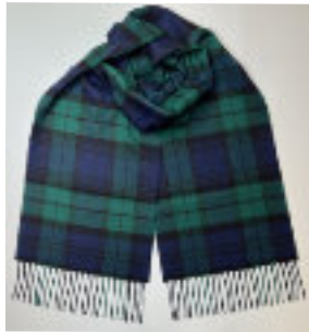
BLACK WATCH WWS795/101

Generously sized at 200 x 30cm, they allow you to wrap up and wear your scarf however you like to.