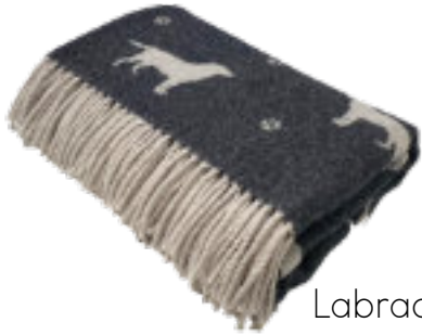
Labrador Black THR 756/008