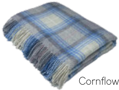
Cornflower THR 747/006