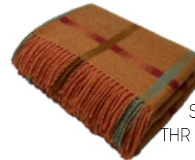
Spice THR 756/038