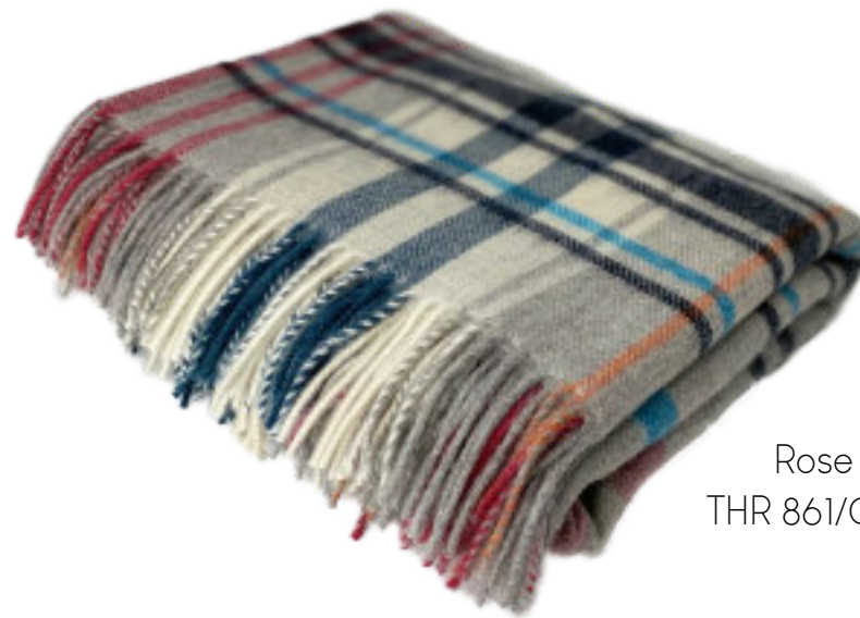
Rose THR 861/006