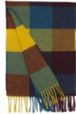
STORM – WWS778/004