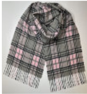
ROSE QUARTZ WWS795/201