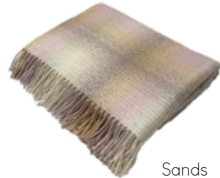
Sands THR 848/003