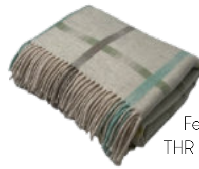
Feather THR 756/033