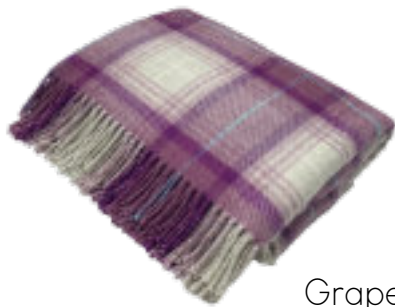
Grape THR 747/005