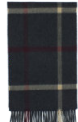
BETSY – WWS778/103