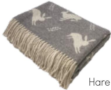
Hare Grey THR 756/001