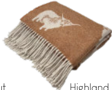
Highland Cow Rust THR 756/009