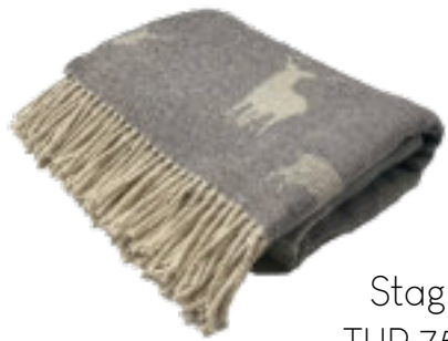
Stag Grey THR 756/006