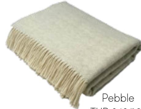
Pebble THR 848/101