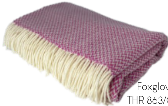
Foxglove THR 863/006