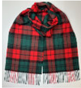
REGIMENTAL RED WWS795/102