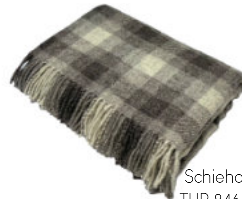
Schiehallion THR 846/002