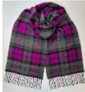
ROYAL PURPLE WWS795/103