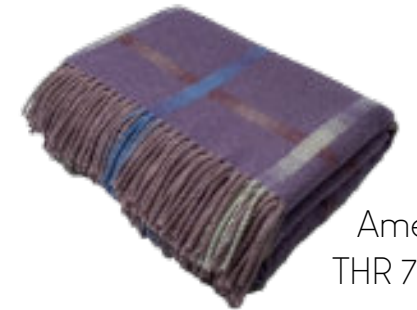
Amethyst THR 756/035