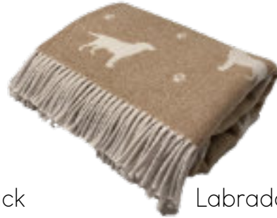
Labrador Bran THR 756/003