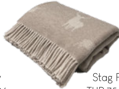
Stag Fawn THR 756/002