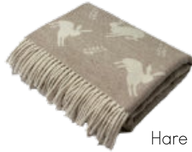
Hare Fawn THR 756/007