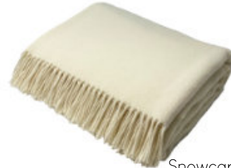
Snowcap THR 849/001