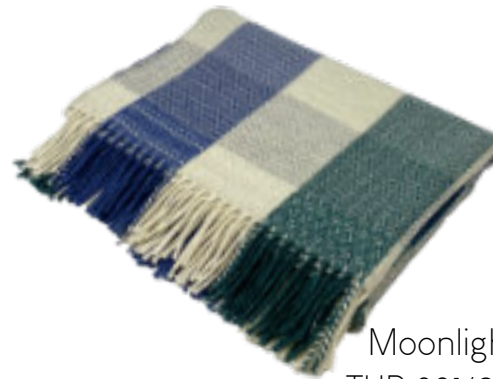
Moonlight THR 831/006