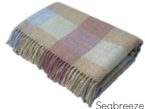
Seabreeze THR 831/002