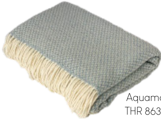
Aquamarine THR 863/003