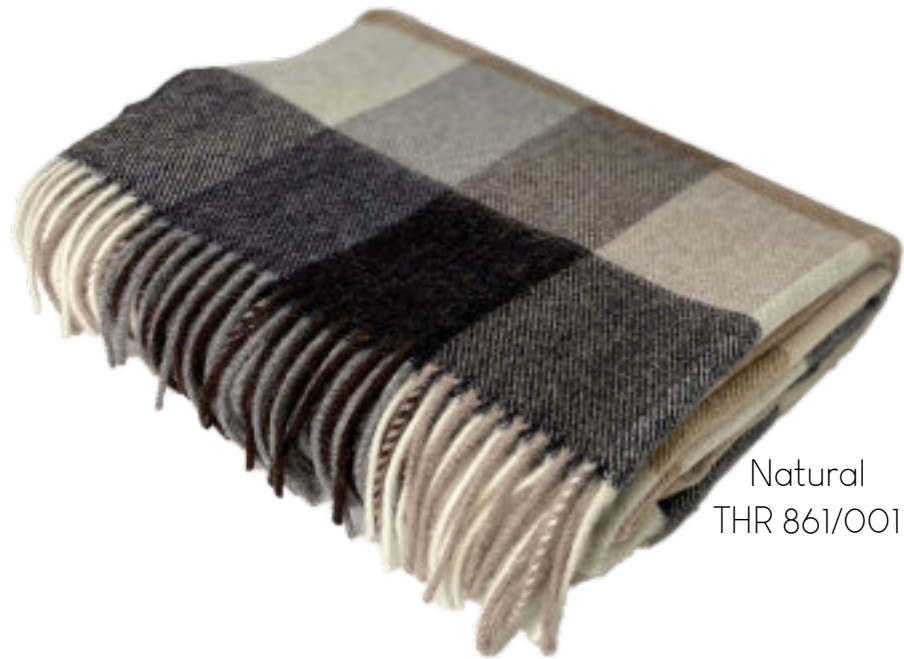
Natural THR 861/001