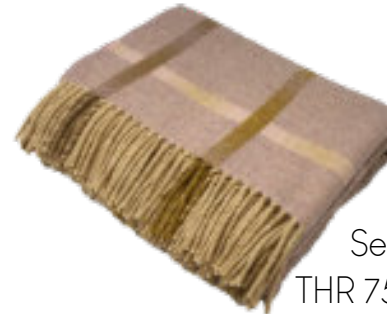
Sepia THR 756/032