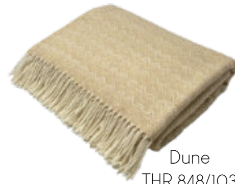
Dune THR 848/103