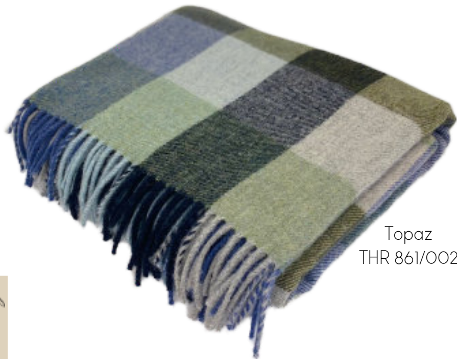
Topaz THR 861/002

Dunira 100% lambswool Size 140cm x 180cm