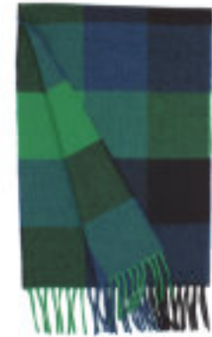
LANTERN – WWS778/003