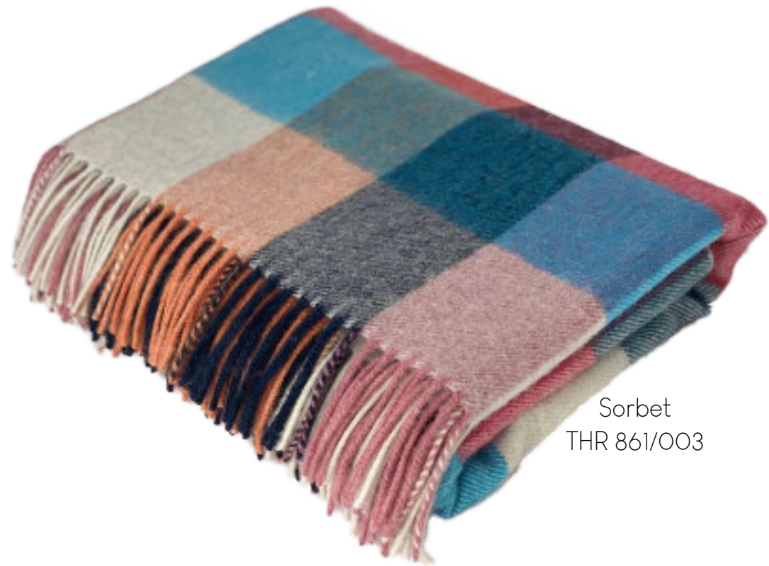
Sorbet THR 861/003