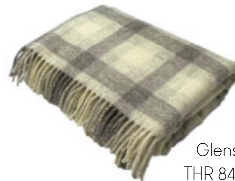
Glenshee THR 846/001