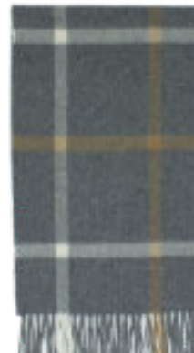
ROGUE – WWS778/101