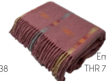
Ember THR 756/036