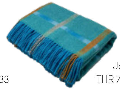
Jade THR 756/037