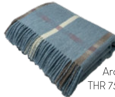
Arctic THR 756/031