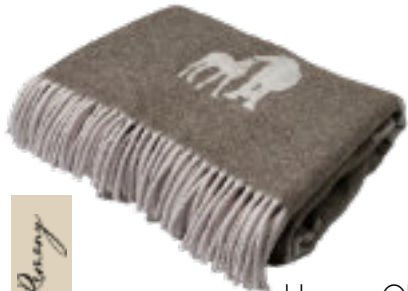
Horse Chesnut THR 756/012