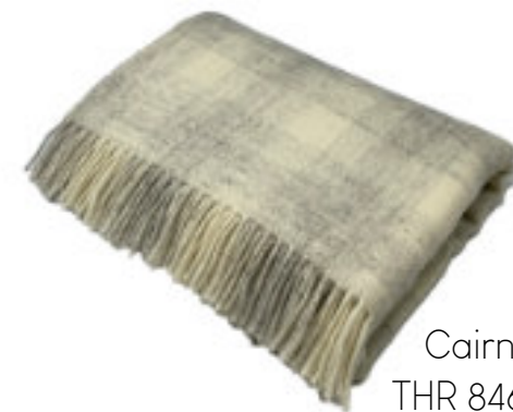
Cairnwell THR 846/003