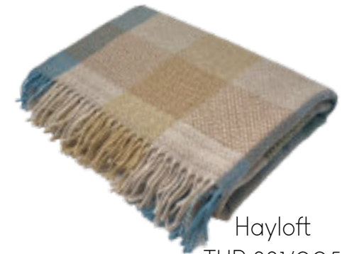
Hayloft THR 831/005