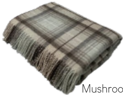
Mushroom THR 747/004