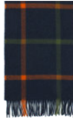
JEAN – WWS778/102