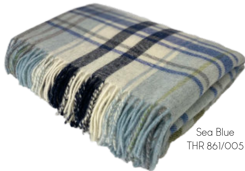
Sea Blue THR 861/005