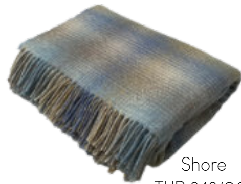
Shore THR 848/001