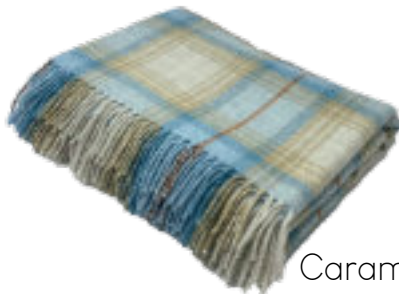
Caramel THR 747/002